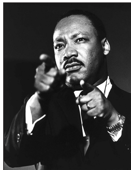
Martin: preached peace and inspired millions

And it looks like it will go about as well as the whole Mayor thing..