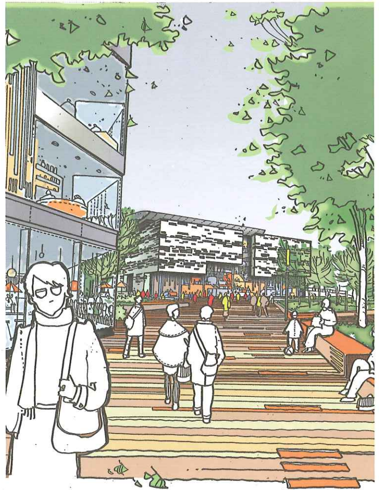
View across new campus, above; and below the main academic building dubbed the 'Sugar Cube' due to its contemporary design.