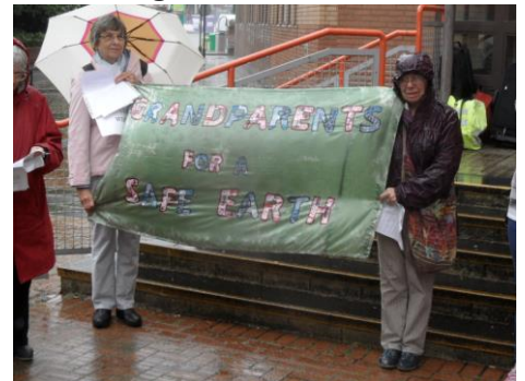
Foul-weather friends outside Court

On a more joyous note, we had an information stand at the Celebrating Age Festival in Bristol in October. 500 people from 75 organizations are represented at this annual festival, which provides an opportunity to speak to members of the public about our work. Less visible, but no less important, is our behind-the-scenes lobbying. Two of our members regularly attend meetings of some of our pensions providers. All County Council Pensions schemes are required to merge into larger “pools” by 2018, and we are concerned that these pools may become less accessible. The new Brunel Pension Partnership, which will cover the West of England will be starting in 2017. We intend to be there to pose questions about County Council policies around investing in fossil fuels, which currently runs at an approximate average of 7% of all their direct investment. This, and fracking are two of the big climate change issues currently facing our part of the world.