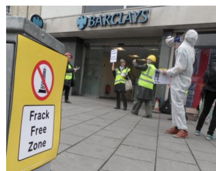
Banking on each other:

Closer to home, we continue to make links with other groups where there is an overlap of interests. In October we teamed up with Friends of the Earth, Fossil Free Bristol and a number of other groups during a week-long protest outside Barclays Bank in Bristol. Barclays is the no.1 player in investing in fracking , a form of fossil-fuel extraction which is becoming increasingly common in the UK. County Council planning departments in the North of England have failed to hold back such developments, and the present Government is committed to extending fracking to parts of Somerset and Wiltshire, in our own area. The planning process is already beginning: we will be there to oppose this process. During Speak Up Week in October, some of our members contacted their Members of Parliament about climate change. This was a national initiative headed by the Climate Coalition, of which we are a member.