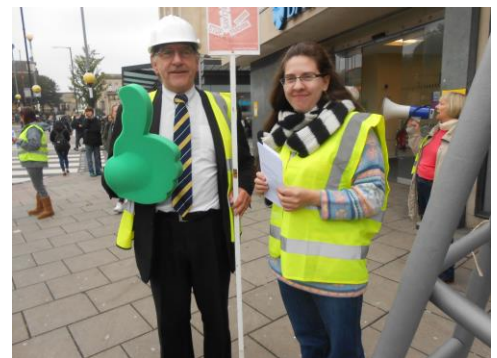
Dressed to drill: 2 generations give the thumbs up to action against fracking

On a more joyous note, we had an information stand at the Celebrating Age Festival in Bristol in October. 500 people from 75 organizations are represented at this annual festival, which provides an opportunity to speak to members of the public about our work. Less visible, but no less important, is our behind-the-scenes lobbying. Two of our members regularly attend meetings of some of our pensions providers. All County Council Pensions schemes are required to merge into larger “pools” by 2018, and we are concerned that these pools may become less accessible. The new Brunel Pension Partnership, which will cover the West of England will be starting in 2017. We intend to be there to pose questions about County Council policies around investing in fossil fuels, which currently runs at an approximate average of 7% of all their direct investment. This, and fracking are two of the big climate change issues currently facing our part of the world.