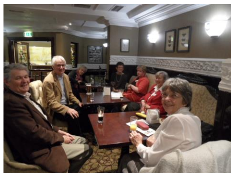
Picking brains at an Irish U3A branch

Other planning processes are also receiving our attention. The expansion of out-of-town shopping centres encourages not only increased consumption of goods made from diminishing global resources, but also in car travel to these shopping centres. Both these are climate change issues. Some of our members are involved in using the planning process, in David-and-Goliath fashion, to hold these corporations to account, the Cribbs Causeway Centre being our current target.