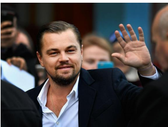
Leo Dicaprio comes to the West Country!