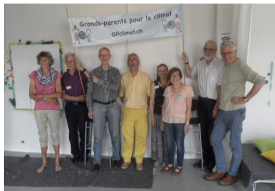
Five nations, one climate. Lausanne July

Since our last newsletter in March we have been involved in actions prompted by developments within the climate change field. Following the Paris talks last December (COP 21) the newly-formed International Alliance of Grandparents for the Climate ( www.gpclimat.ch ) had its first meeting in Lausanne in Switzerland in June, and this was attended by one of our members. We are a small group, and such links are important to our work. After all, the climate covers the whole planet.