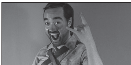
Oliver uses a trusty old PR distraction technique...

Indeed. Forced labour and rambling pieces of self-justifying PR are certainly one way "to shake things up" in the balls of power!