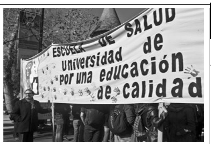
Chilean Students are campaign against privatization

These social mobilizations demonstrate the failure of the "Chilean model", a neoliberal system imposed after the coup d'édat by Pinochet's juggernaut regime and modelled by the "Chicago boys"-Milton Friedman et al. The "Chilean model" facilitated the privatization of social services. For instance, in education, where in "public" universities, students pay over 20,000 Euros to acquire a degree. In private universities (where 80% of the universities students are studying due to the low intake of students in public universities) the prices rocket up to 60,000 Euros. This lucrative use of education benefited large corporations and the banks that pocketed the debts and its